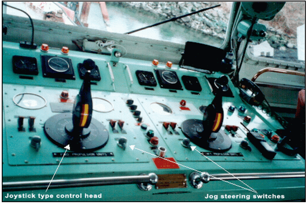
Figure 4. View of control console showing control heads, jog steering and rudder angle indicators.

Shore authorities were notified of the incident and, with the vessel in the dock, the ship's crew carried out further tests on the legs and their hydraulic and electronic control systems, in an attempt to determine the cause. No abnormality was found and the vessel resumed its normal operations.