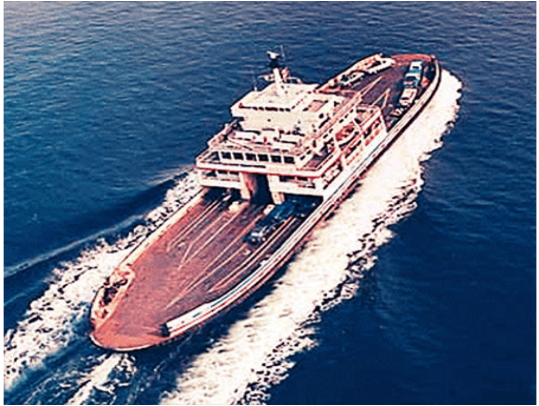
Figure 1. Aerial view of vessel showing wheelhouse, vehicle deck and double ended features.

Each wheelhouse control console overlooks its half of the vehicle deck and by means of a 'transfer' switch, becomes the active or 'live' control station. There are two 'joystick' type control heads at each console and one pair of 'end' RADs is controlled by each joystick (see Figure 4). The vessel being double-ended, either console can be used for manoeuvring.