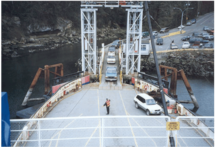
Figure 3. View of vehicle deck and a loading operation as the ferry is pushing against the wing walls of the dock.

At about 1755 on 13 April 2002, the Bowen Queen departed Nanaimo Harbour for the scheduled crossing to Descanso Bay, Gabriola Island. The crossing was uneventful and the vessel arrived at Descanso Bay at 1820. When in position at the dock the master aligned all four RADs in the 'pushing in' direction, the shore ramp was lowered and the discharging of foot passengers and vehicles commenced.