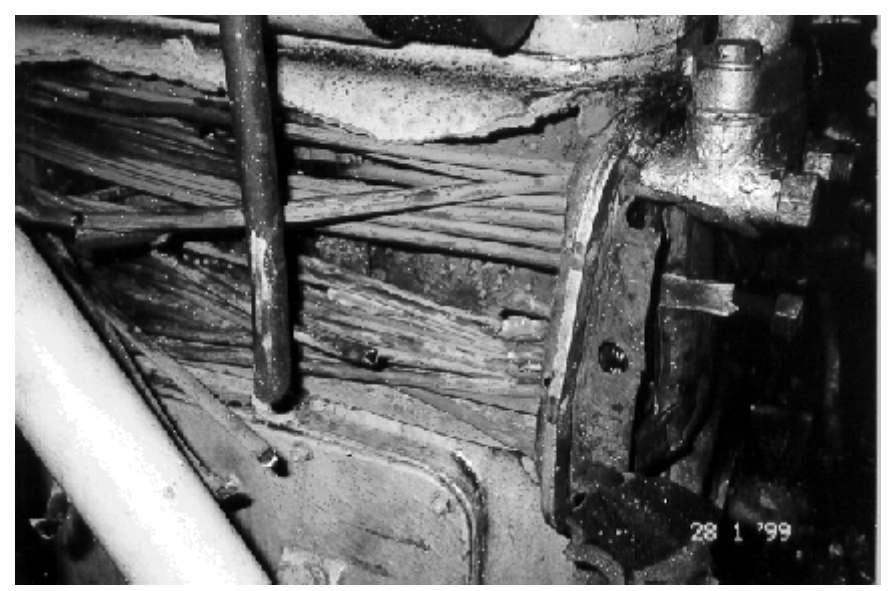
Photo 2. Burst high pressure air cooler tubes and fractured casing.