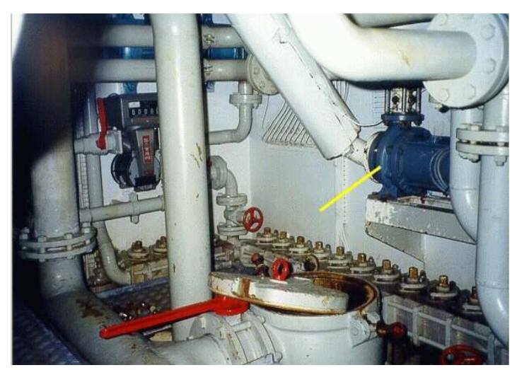
Photograph 3. Port liquid refrigerant pump

According to the two engineers who entered the engine room several times after the blackout, the only piece of equipment noted to be damaged was the standby (starboard) refrigerant pump. The pump was reported as having disintegrated or exploded. Although the pump was not in service at the time of the failure, its isolation valves were still open and when the pump failed, the entire charge of refrigerant was free to escape to atmosphere.