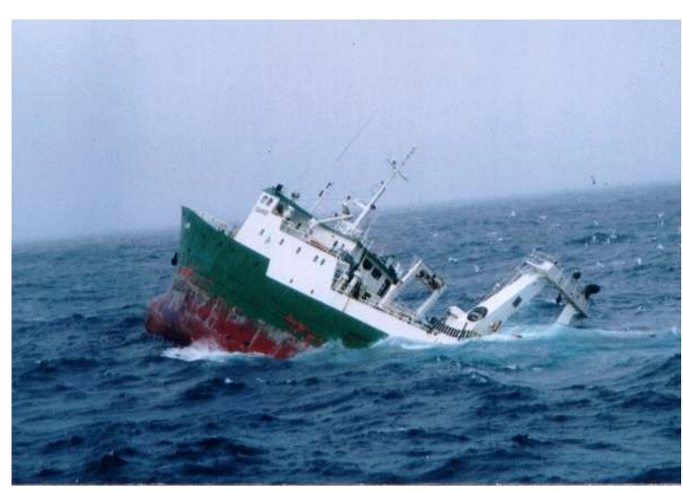
Photograph 2. F.V. Fame, pronounced list.

At approximately 0800, the vessel again lost electrical power and blacked out. The SCBA air supply was also close to running out, and the engineers left the factory deck for the final time, leaving the engine room door open. With the vessel now under tow, the list increased to 28° to 30° and at approximately the same time a rescue aircraft arrived and dropped four portable salvage pumps. As the air drop was being carried out, the situation was considered critical and the decision was made to abandon ship.