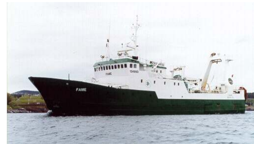
Photograph 1. F.V. Fame

The location of the engine room, decks, watertight hatches, oil fuel, water ballast, and freshwater tanks, refrigerated upper and lower holds, shrimp-processing areas, and crew accommodation, etc. were as shown in the Outline General Arrangement (see Figure 1).