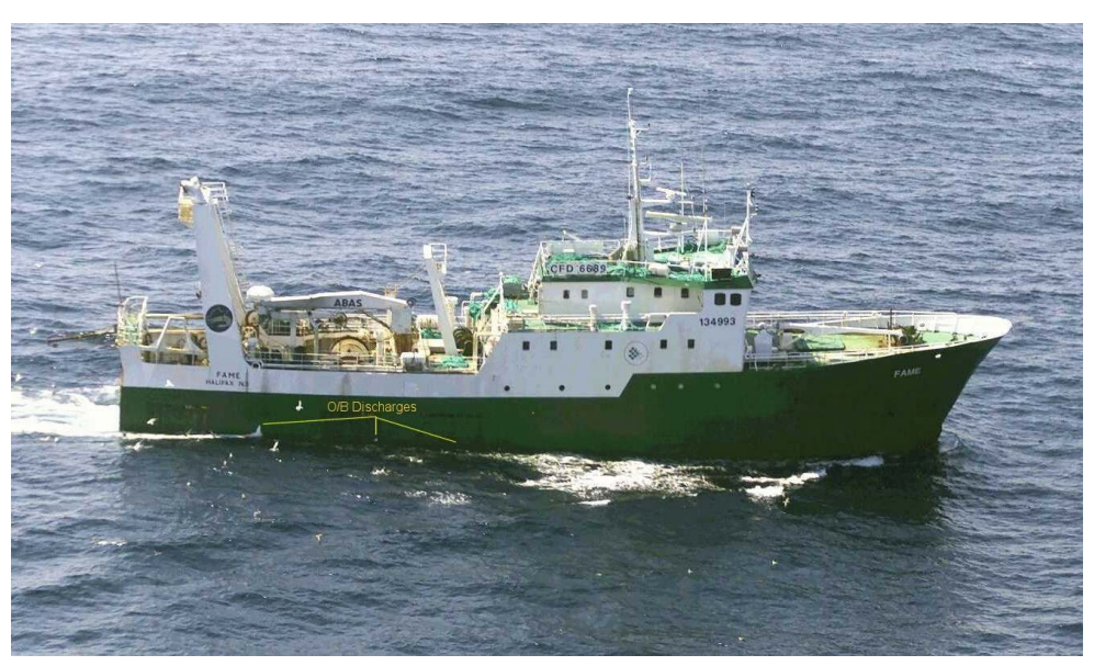
some 13 hours after Photograph 4. O/B discharge valves

The overboard discharge valves were located above the factory deck and relatively close to the operating waterline such that, while the vessel was in calm water and heeled 3° or 4° to starboard, the valves remained above sea level. This trimmed and heeled condition was maintained for the initial loss of