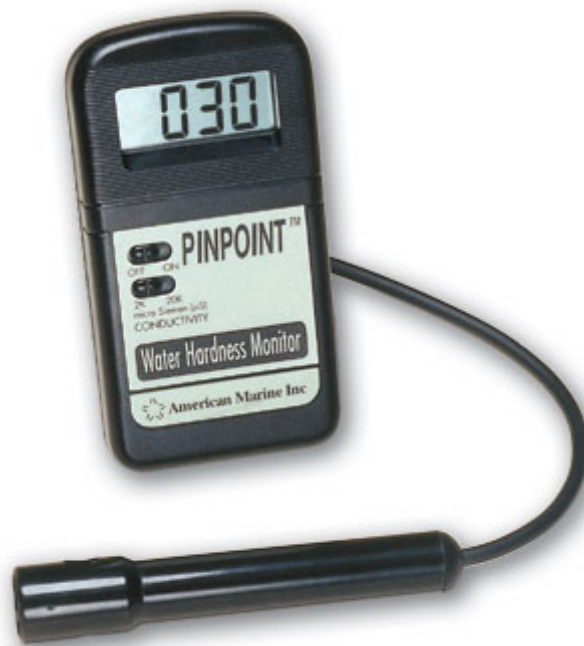
Figure 2. The Pinpoint conductivity meter.

If you choose a meter that reads in mS/cm, then all of the concern about ppm units that is described below can be eliminated. The Pinpoint Conductivity meter is such a unit (Figure 2). Some devices allow either unit to be displayed, although these are usually more expensive, such as the Oakton Con 200 (Figure 3).