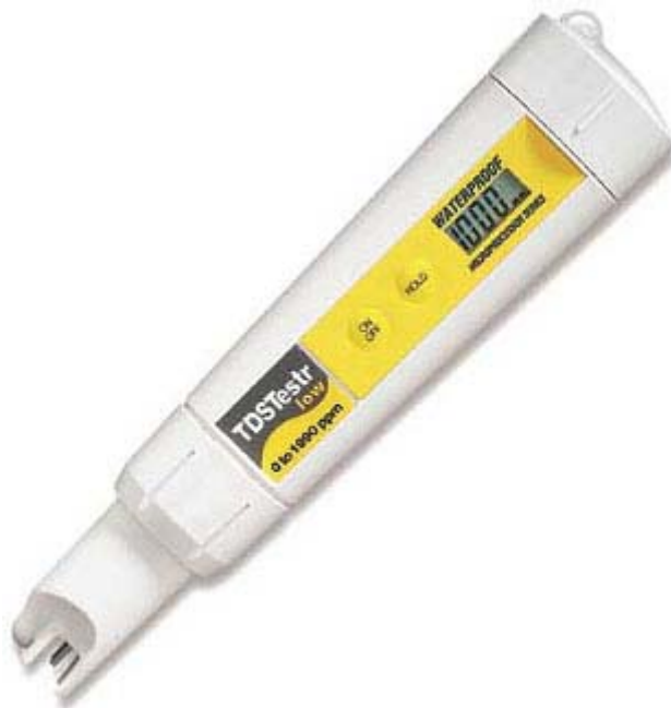
Figure 4. The Oakton TDS Tester.

Unfortunately, there is no single exact conversion between conductivity and ppm NaCl as the conductivity of a sodium chloride solution is not linear with concentration (that is, 20 ppm NaCl is slightly less conductive than twice that of 10 ppm NaCl, the reasons for which are beyond this article, but in a sense, the more ions there are in solution, the more they interfere with each other in terms of sensing the voltage, and in terms of moving in response to it). Nevertheless, for values in the range sensed by most TDS meters, a rough conversion is that 1 ppm NaCl = 2.1 \mu\text{S}/\text{cm} .